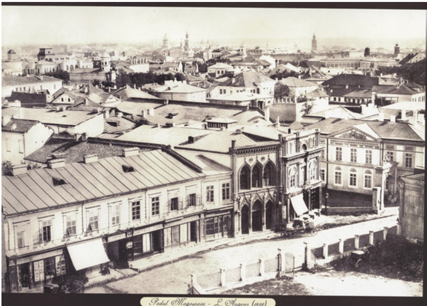
FIGURE 8.3 Rooftop view of Bucharest, 1856.

Bucharest (Figure 8.3) is somehow both enormous and unworthy; immeasurably ancient, but also behind the times. And while it may one day become “a great and world renowned capital,” any chance of it “assuming a more regular direction” will clearly “take much time.” Specifically, the trick of perspective afforded by the trope of the foreign traveller provides a characteristic view of Romanian society between old and new, between disorder and order.