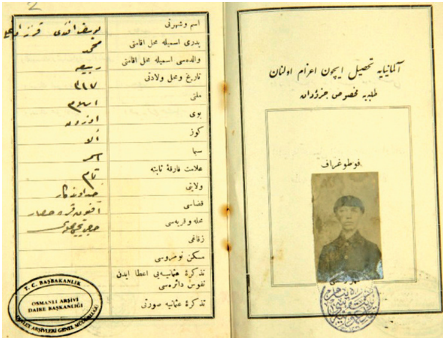
FIGURE 6.1 Passport photo of an orphan sent to Germany in 1917.

barefoot. This partially explains why so many of them were sent back after a few months: they had lung diseases.