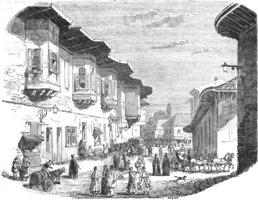
FIGURE 8.4 Charles Doussault, Bucharest Street Scene, 1841

Romanians (“Petrescu”). And at yet another, these narrow streets with closed-in vistas, metonymic of the past, are placed in implicit opposition to the urban landscape of the modern 1880s, with its statue of “Lazăr,” (Figure 8.5) the teacher from Transylvania who had pioneered Romanian-language schooling in the 1810s, now commemorated in the modern way, in marble, at the corner of modern, perpendicular boulevards, in a city with an Academy. 36