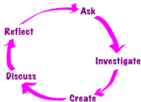
Fig. 1.1: Five steps in an inquiry cycle lead naturally to the next cycle

Available under Creative Commons-ShareAlike 4.0 International License (http://creativecommons.org/licenses/by-sa/4.0/) .