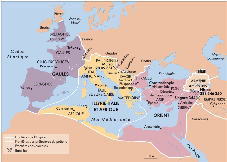
CARTE 1.2 Un problème stratégique : la guerre sur trois fronts. Vers 340, les préfectures régionales du Prétoire sont une solution administrative.

de 325 fut un processus complexe, car, comme l'a montré Pierfrancesco Porena, leur nombre varia selon la logique stratégique des trois fronts, les héritages tétrarchiques et l'adaptation politique au nombre des héritiers de Constantin. 17 En effet, l'existence des douze diocèses créés par Dioclétien permettait différents types de découpages. La logique stratégique des trois grandes préfectures du prétoire qui s'imposa après 340 reprenait de fait la division politique des années 270 (voir cartes 1.1 et 1.2). Mais elle tenait compte de la réflexion tétrarchique qui avait rassemblé l'Orient et le Bas-Danube dans un même ensemble défensif. Ceci amena l'installation durable d'une résidence impériale sur les détroits, avec Nicomédie d'abord, et Constantinople ensuite. Mais le rang de nouvelle capitale attribuée à celle-ci eut des conséquences immédiates, fiscales avec l'attribution de l'annone d'Égypte au ravitaillement de Constanti-