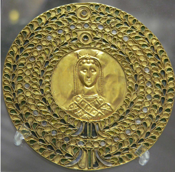
FIGURE 6.3 Fifth-century enamel and gold-leaf medallion depicting Licinia Eudoxia, daughter of Theodosius II and wife of Valentinian III – entrusted with the role of bridging the eastern and western halves of the dynasty. PHOTO © DÉPARTEMENT DES MONNAIES, MÉDAILLES ET ANTIQUES, BIBLIOTHÈQUE NATIONALE DE FRANCE, INV. M. 1688.

prestigious burial basilicas housing the believed tombs or memoriae of Peter and Paul with processional roads and arches. 19