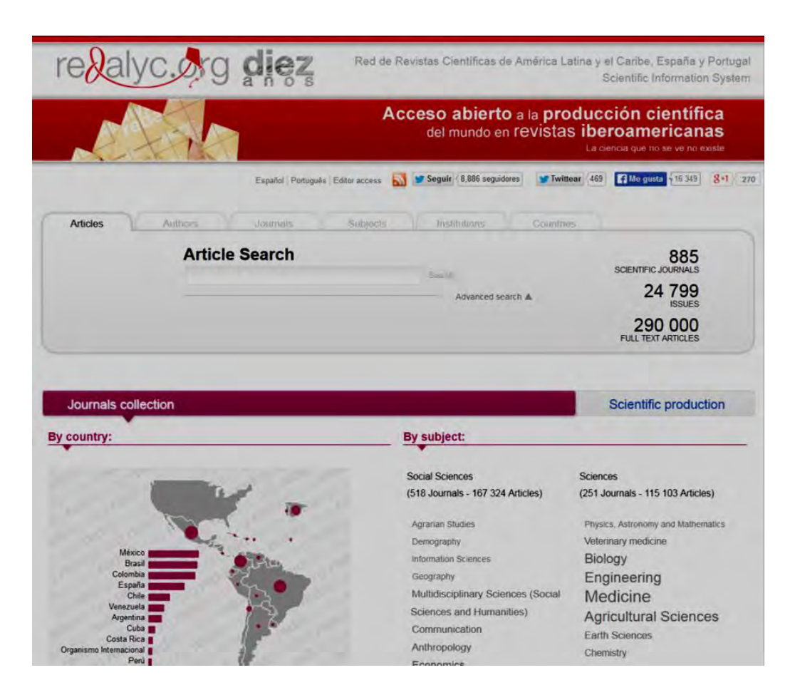
Figure 3: Homepage of Redalyc.org Scientific Information System

The portal generates certain indicators and usage statistics that measure citations and usage of archived papers in this platform. This portal has different searching and navigation options for easy retrieval of archived documents from its databases.