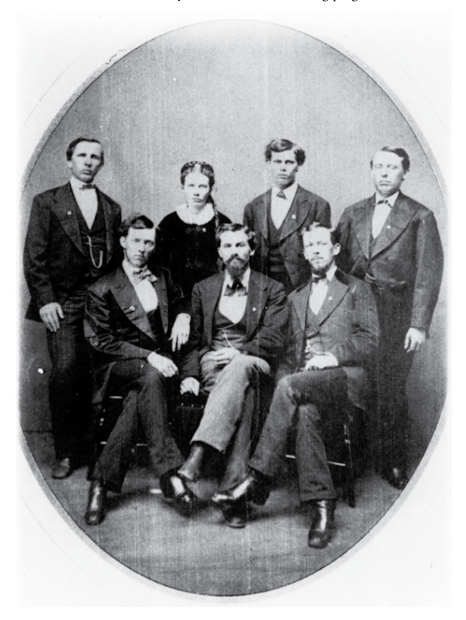
Figure 1. The Ohio University Class of 1873.

a college student when she produced it, she discusses her rhetorical education in it, and she viewed the diary as a record of her writing progress. For her first