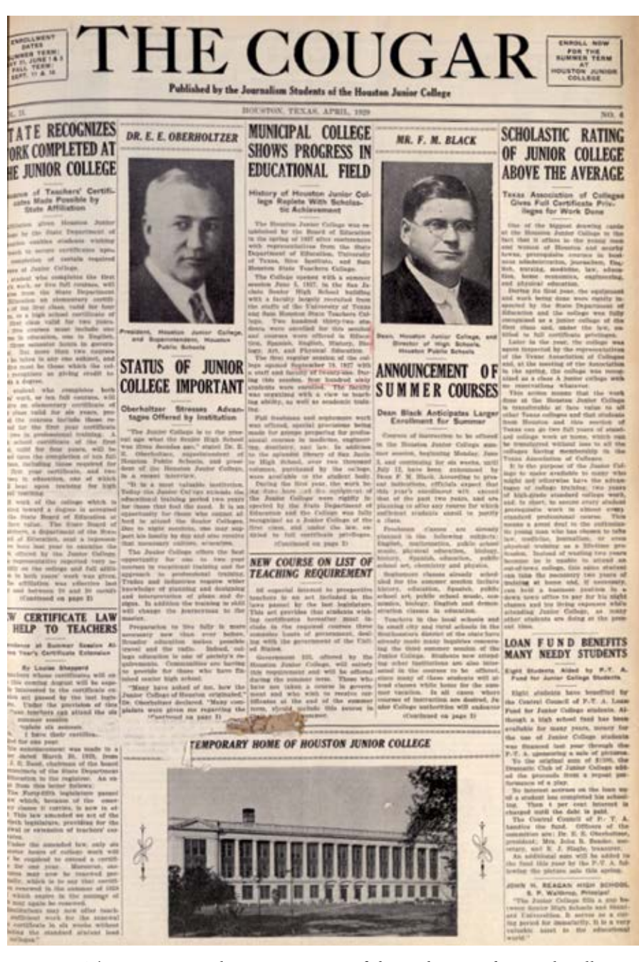
Figure 2. The Cougar, April 1929.