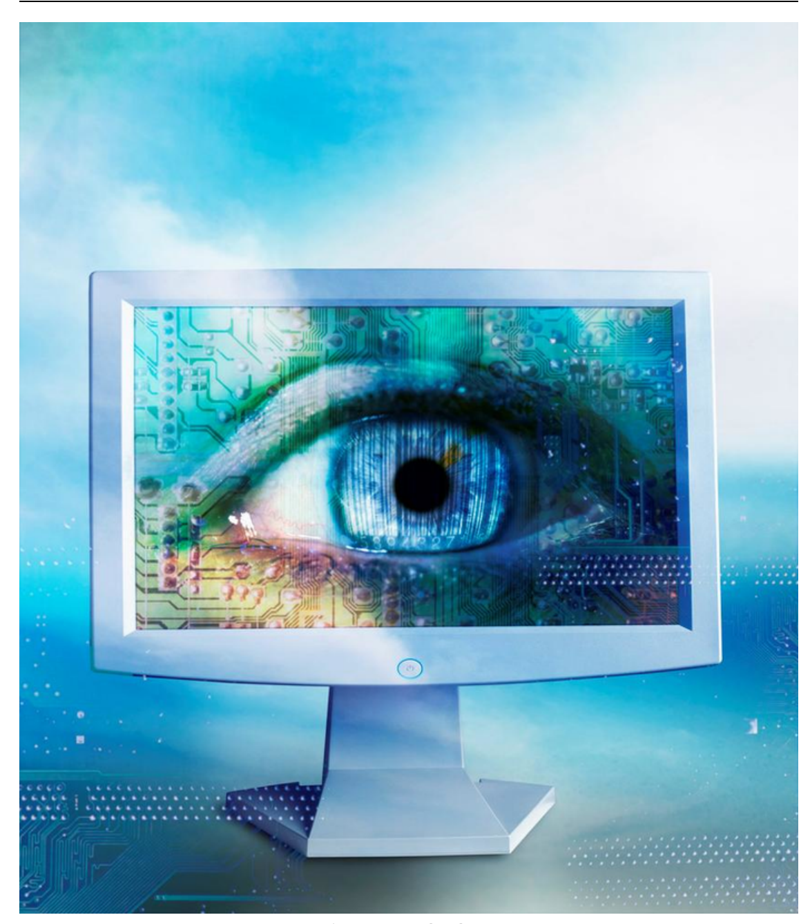
Figure 8.1 Technology