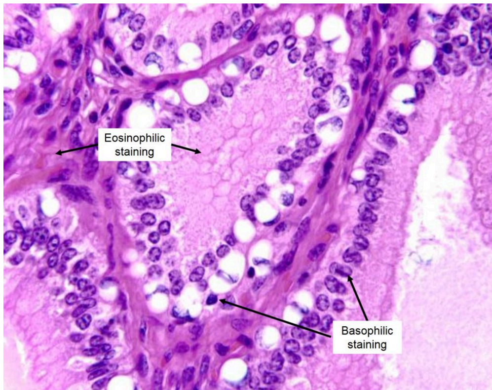
Basophilic and eosinophilic staining in a tissue section.

Basic components (various kinds of cytoplasm and intercellular substance) take acid dyes (e.g., eosin), and are called acidophilic or eosinophilic (pink). Please note that there are numerous stains used to evaluate tissue for different purposes. Hematoxylin and eosin (or H&E) staining is the most common method of staining used for histologic sections.