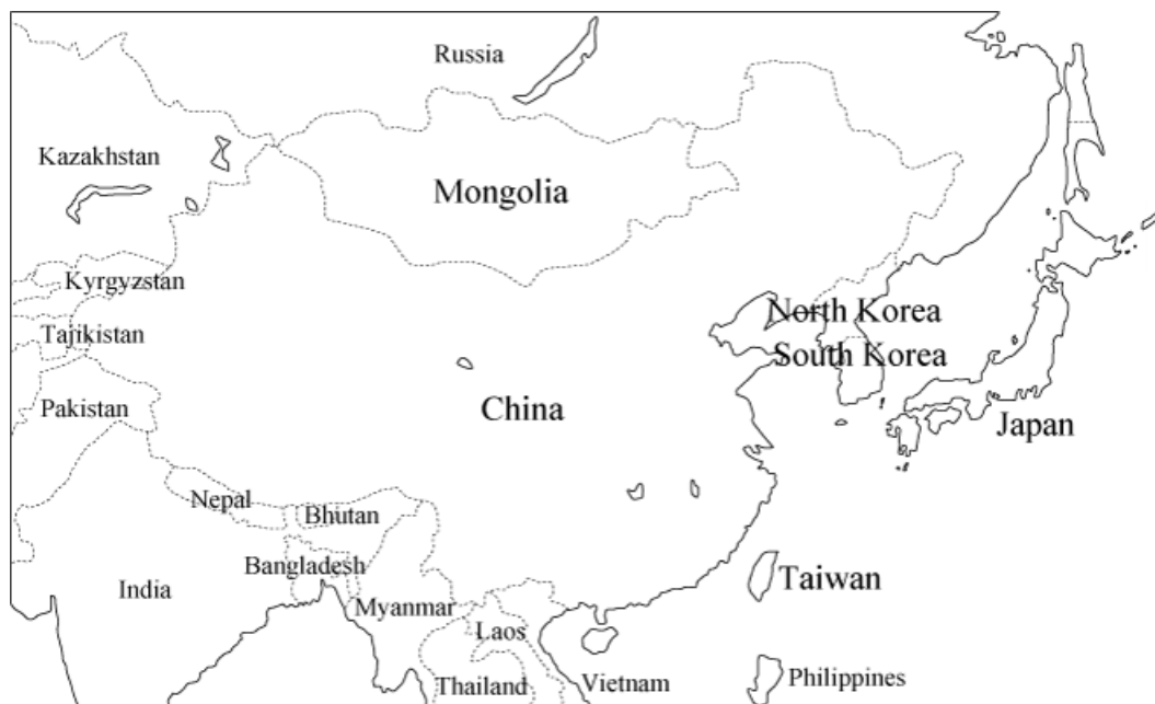
Figure 1.6: The Far East (This map was obtained from http://english.freemap.jp/index.html 16 and is used with permission under a Creative Commons Attribution 3.0 license 17 .)