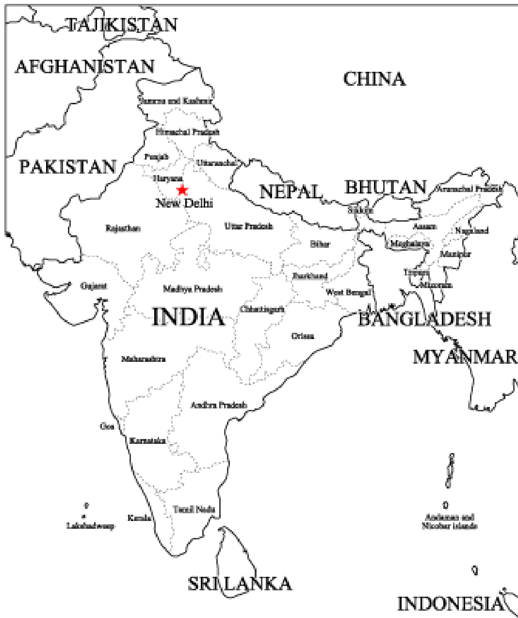
Figure 1.5: Indian Subcontinent This map was obtained from http://english.freemap.jp/index.html 13 and is used with permission under a Creative Commons Attribution 3.0 license 14 .)