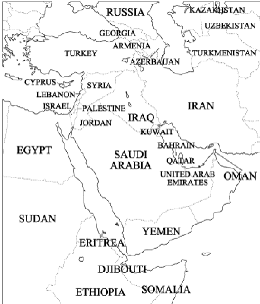
Figure 1.2: The Near East (This map was obtained from http://english.freemap.jp/index.html 4 and is used with permission under a Creative Commons Attribution 3.0 license 5 .)