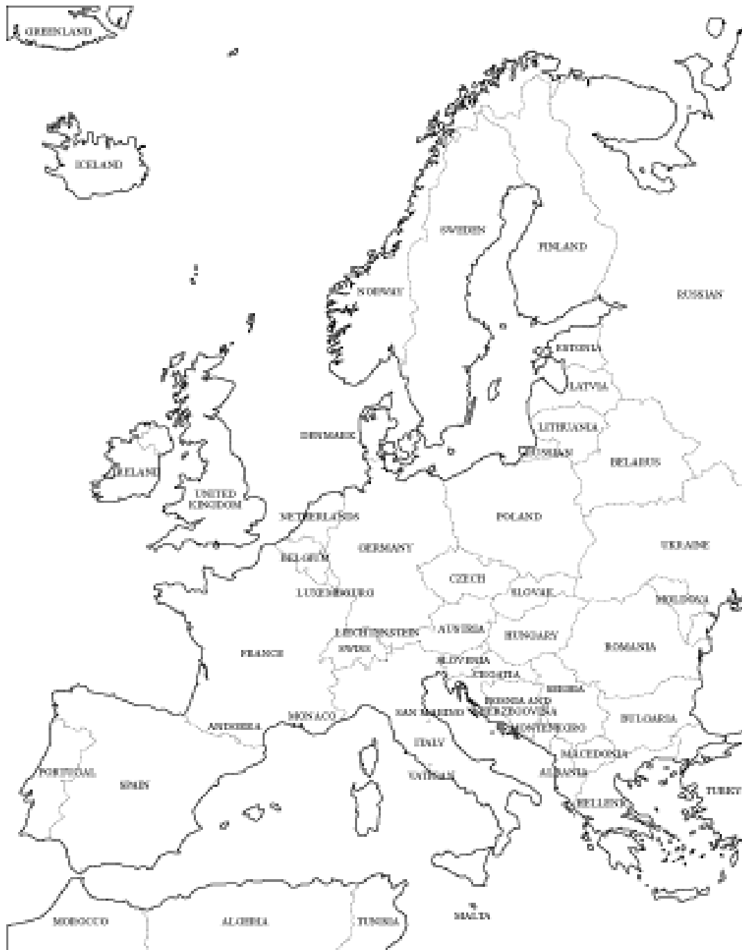
Figure 1.3: Europe