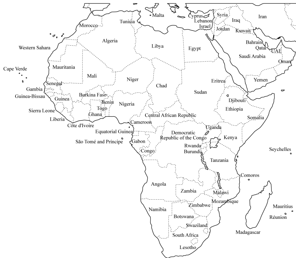
Figure 1.1: Africa

This area extends from far west Africa across the Sudanic plain as far east as the Lake Chad environs, then down to the equatorial district as well as central, east and south Africa and the major islands. This very large spread of land has many and varied peoples and cultures, but historical material is still relatively meager for most of it and from the standpoint of manuscript space, it seems best to consider it under one section.