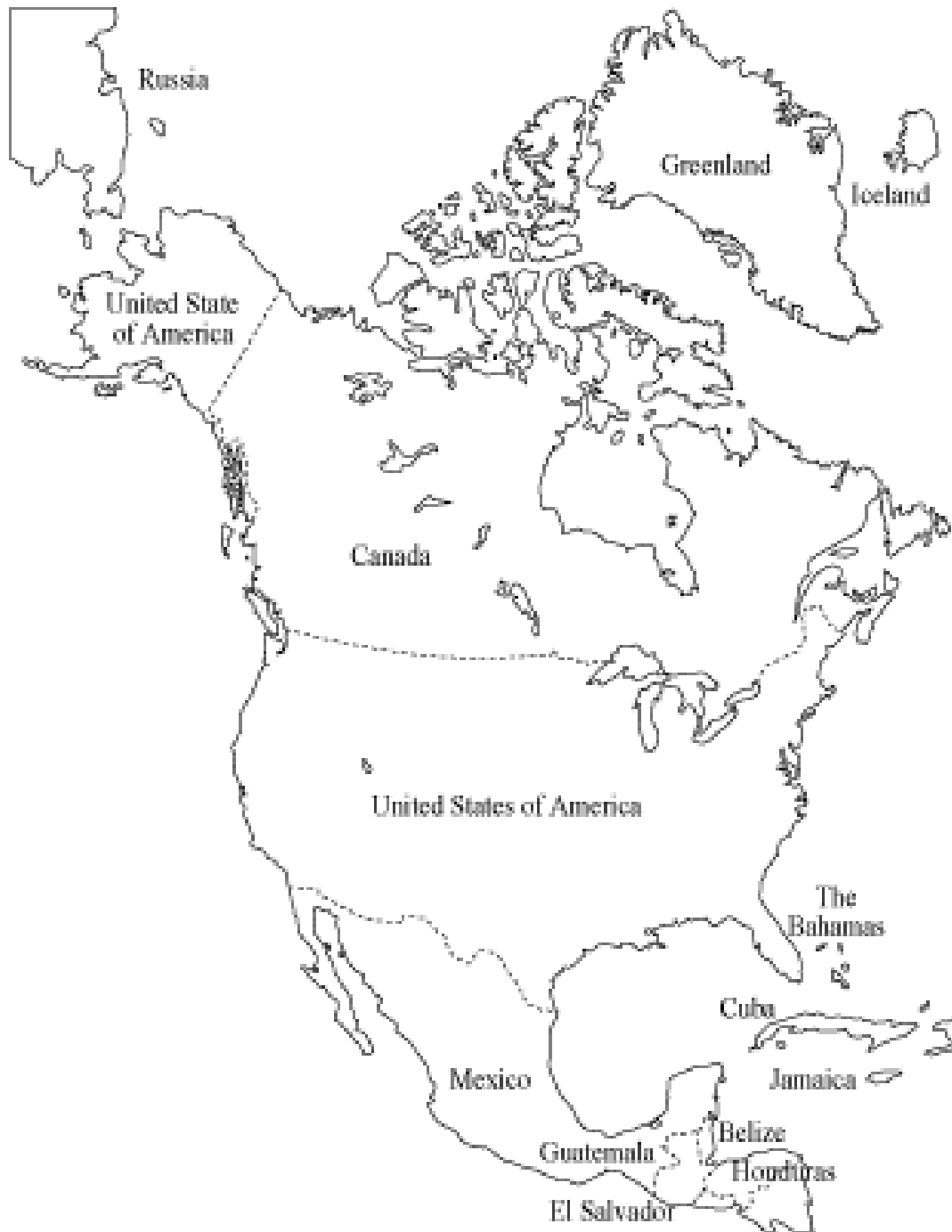
Figure 1.9: North America (This map was obtained from http://english.freemap.jp/index.html 20 and is used with permission under a Creative Commons Attribution 3.0 license 21 .)